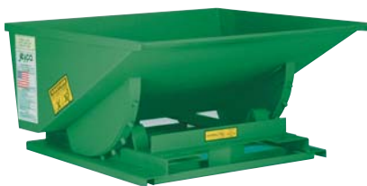
¼ cu. yd. shown

7 gauge body • 8 gauge base • Stackable 3 high empty • Manufactured to order