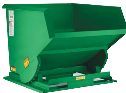
2 1/2 cu. yd. shown

7 gauge body • Base: 8 gauge (1/4-1/2 yd.) / .220 gauge (3/4-2 1/2 yd.) • Stackable 3 high empty