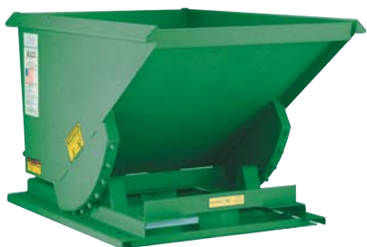
1 cu. yd. shown

10 gauge body • 8 gauge base • Stackable 3 high empty