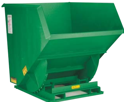
3 cu. yd. shown

7 gauge body • Base: 1/4" (3-6 yd.) / 3/8" (8-10 yd.) • Non-stackable • Manufactured to order