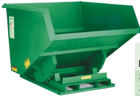
2½ cu. yd. shown

7 gauge body • 1/4" base • Non-stackable • Manufactured to order