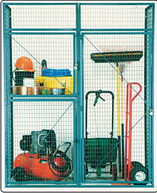
Industrial storage application