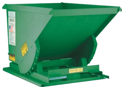
1/2 cu. yd. shown

12 gauge body • 8 gauge base • Stackable 3 high empty